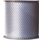
55 MESH WIRE STAINLESS STEEL CONSTRUCTION (For High Heat Applications)