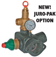
VACUUM PRESSURE TREE MORE OPTIONS SEE PAGE 213